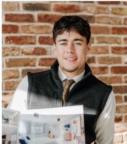
Meet Theo Property Consultant