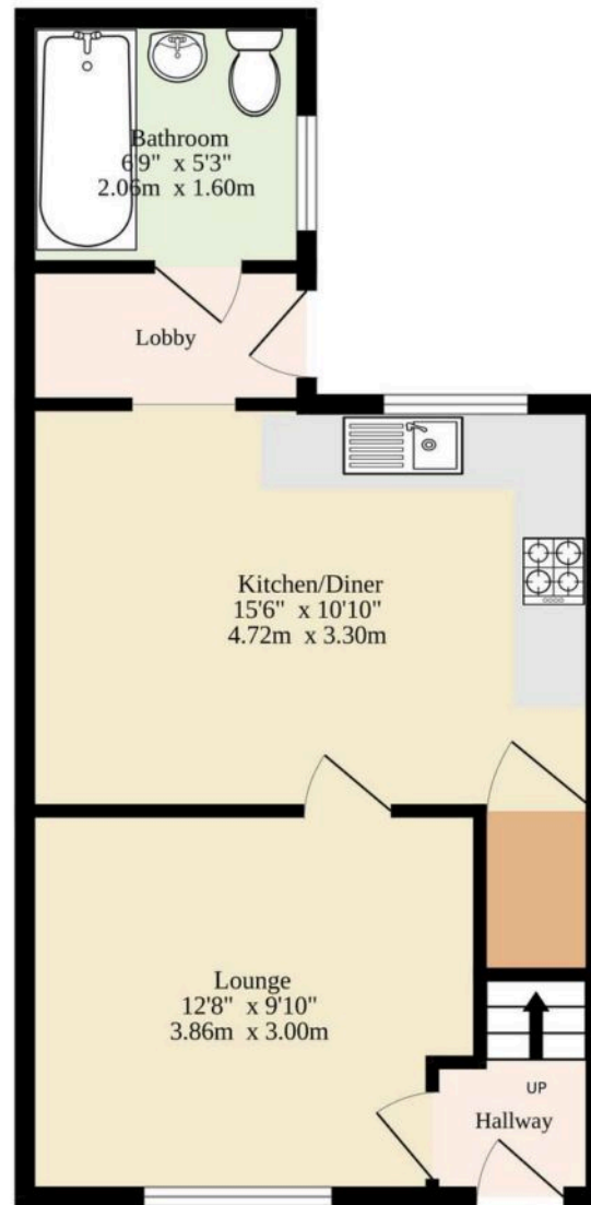
Ground Floor 346 sq.ft. (32.1 sq.m.) approx.