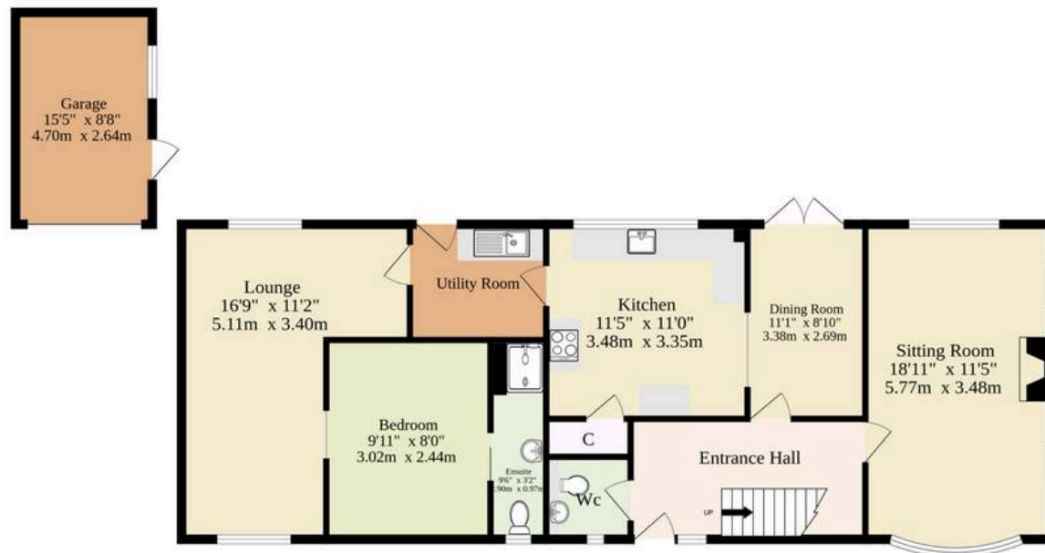
Ground Floor 1047 sq.ft. (97.3 sq.m.) approx.