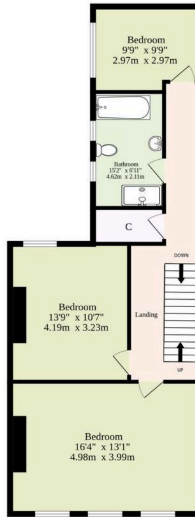
1st Floor 725 sq.ft. (67.4 sq.m.) approx.