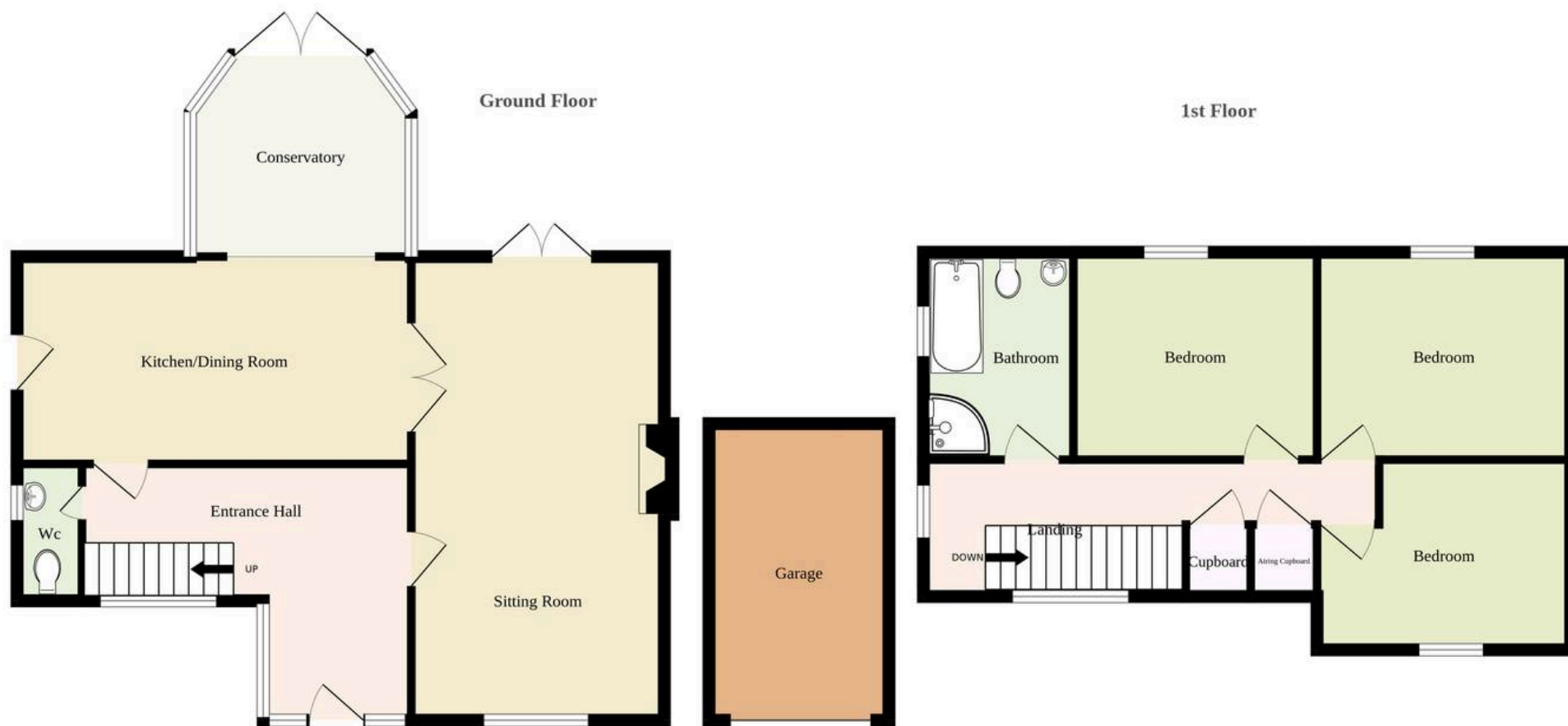
Fir Tree Close Weybread Ip21 5tf

Whilst every attempt has been made to ensure the accuracy of the floorplan contained here, measurements of doors, windows, rooms and any other items are approximate and no responsibility is taken for any error, omission or mis-statement. This plan is for illustrative purposes only and should be used as such by any prospective purchaser. The services, systems and appliances shown have not been tested and no guarantee as to their operability or efficiency can be given. Made with Metropix ©2026