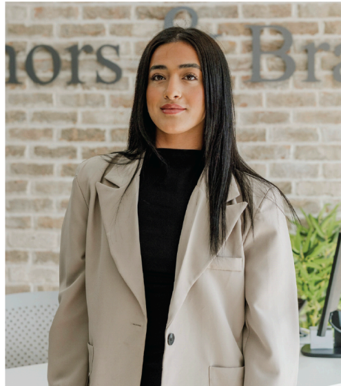
Meet Aysegul Aftersales Progressor