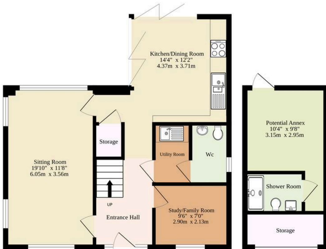
Ground Floor 782 sq.ft. (72.7 sq.m.) approx.