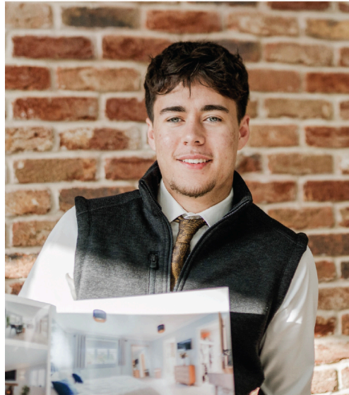
Meet Theo Property Consultant