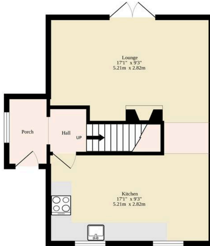
Ground Floor 403 sq.ft. (37.4 sq.m.) approx.