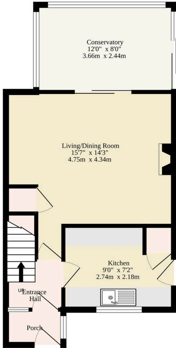
Ground Floor 434 sq.ft. (40.3 sq.m.) approx.