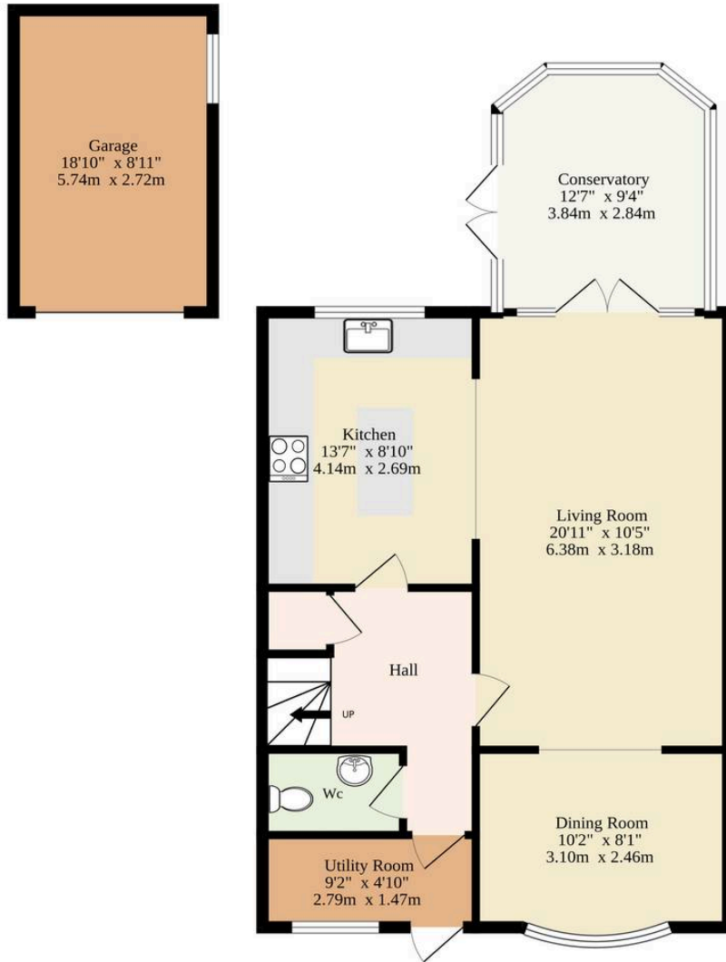
Ground Floor 761 sq.ft. (70.7 sq.m.) approx.