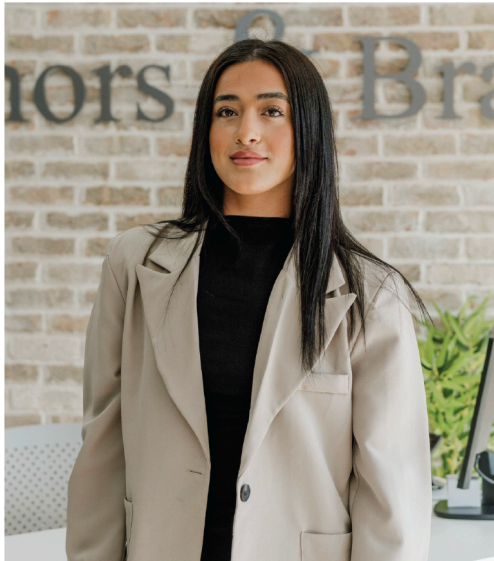
Meet Aysegul Aftersales Progressor