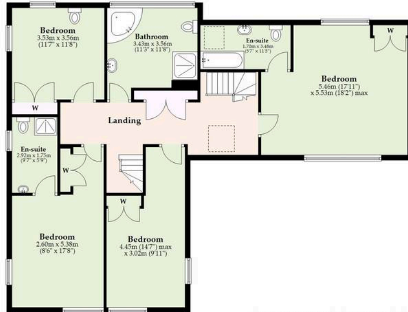
First Floor Approx. 125.1 sq. metres (1346.4 sq. feet)